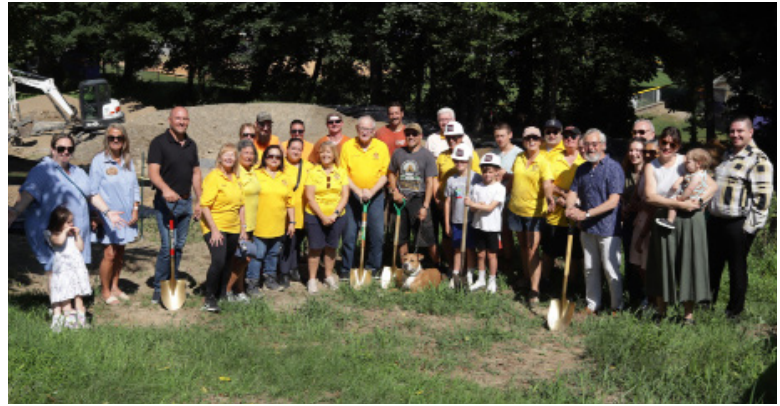
On June 20, Warwick Skatepark Initiative held their groundbreaking for the new skatepark in Veterans Memorial Park. On July 8, the Warwick Lions club held a ground breaking for the pump track, also located in Veterans Memorial Park.